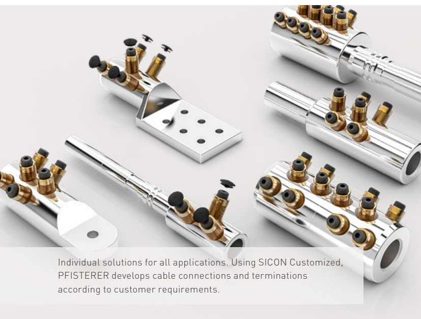
Individual solutions for all applications. Using SICON Customized, PFISTERER develops cable connections and terminations according to customer requirements.

As a full-service provider, PFISTERER also offers complete system solutions and customized (high-voltage) fittings.