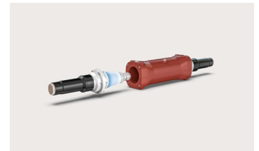
The one-fits-all submarine cable repair solution up to 170 kV is based on the pluggable Connex epoxy resin joint by PFISTERER. It enables completely different cables to be connected, regardless of characteristics such as the manufacturer, materials or cross-section.

TenneT is a leading European grid operator. We are committed to providing a secure and reliable supply of electricity 24 hours a day, 365 days a year, while helping to drive the energy transition – for a more sustainable, reliable and affordable energy future. In our role as the first cross-border transmission system operator (TSO), we design, build and operate over 25,000 kilometres of high voltage and extra high voltage networks in the Netherlands and large parts of Germany. With our 17 interconnectors to neighbouring countries, we facilitate the European energy market. With a turnover of EUR 9.8 billion and a total asset value of EUR 41 billion, we are one of the largest investors in national and international onshore and offshore electricity grids. Every day, our 7,400 employees take ownership, show courage and make and maintain connections to ensure that the supply and demand of electricity is balanced for over 43 million people. Lighting the way ahead together